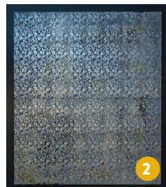
Untitled 2, 2018