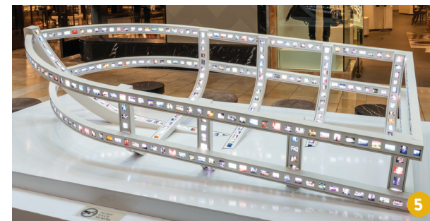
Adrift II, 2018 metal, illuminated 33mm slides 6 ½ x 112 ¼ inches