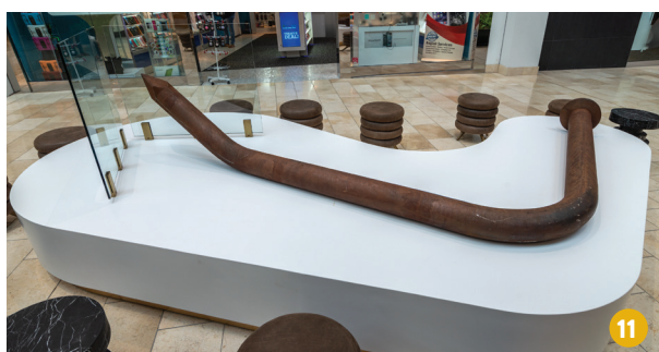
Clavo Veintiuno, 2018 metal 19 ⅞ x 99 ⅝ x 69 ⅞ inches (50 x 253 x 177 cm)

Havana-based collective Los Carpinteros focuses on the intersection of art and society. Kosmaj Toy I is made of black LEGO® bricks, wood, and metal. This playful but history-referencing sculpture is modeled after typical Soviet/socialist monumental sculptural forms from the Cold War era. Trio is a sculptural installation featuring conga drums and a standup bass. Anchored by the artists' trademark sense of humor, this particular salsa band appears to be having a "meltdown" — a metaphor for the psychological meltdown of individuals in some constrained societies. Clavo Veintiuno resembles a giant rusty, twisted nail that reflects the recurring game of scale that the artists play while calling into question the issue of function in this now unusable object.