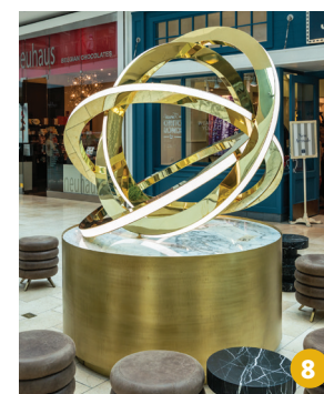
The Luxury Knot, 2018 polished brass, illuminated LED, marble 5' 0" sq x 4' 11" (152.4 sq x 149.86 cm)

The Luxury Knot is a collaboration between designer John Reistetter of Unibail-Rodamco-Westfield & Yellowgoat Design of Australia. The illuminated brass assembly and base pays tribute to the initial decorative lighting concepts conceived in 2013, which established the overall design philosophy of the luxury wing for the Garden State Plaza transformation.