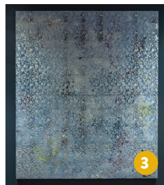
Untitled 3, 2018 aluminum foil, aluminum coating, oil paint on tar paper 48 x 56 inches (121.9 x 142.2 cm)