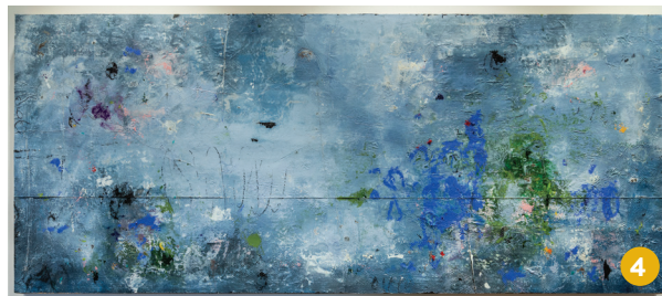
Untitled 1, 2018 aluminum foil, aluminum coating, oil paint on tar paper 36 x 84 inches (91.4 x 213.4 cm)